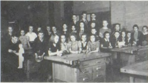
ARTS AND CRAFT