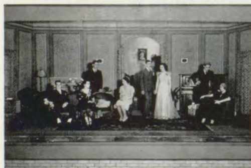
SENIOR CLASS PLAY—1938 The Patsy