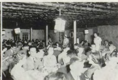
JUNIOR-SENIOR RECEPTION MAY 1938