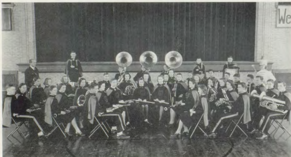
READY FOR CONCERT