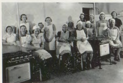
HOME ECONOMICS CLUB