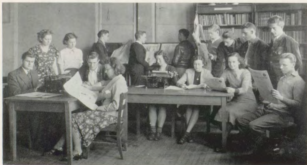
MAKING UP THE HI-LIFE