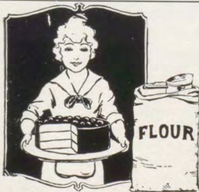
Dutschke Milling Co.

Contributing Its Measure of Happiness to Cannelton's Community Life